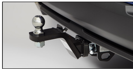
TRAILER BALL PLATFORM $131.40*

Hitches and Accessories have been designed specifically for your vehicle. Please consult your Lexus Dealer for vehicle specific information.