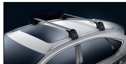
ROOF RACK CROSS BARS

The Lexus 17" silver winter alloy wheels have been specifically designed to equip your NX for winter driving while maintaining its prestigious appearance. Price displayed includes a set of four wheels with tire installation. Tires sold separately.