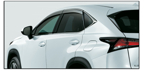
SIDE WINDOW DEFLECTORS $453.50*

Step up in style. Beautifully crafted to complement the design of your vehicle, these lightweight running boards help you gain easy and safe access to your cabin and roof rack. Featuring a corrosion-resistant design, the running boards are built with a reinforced composite structure for strength and durability. An anti-slip surface provides added grip and stability for driver and passengers.