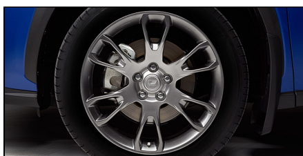
FSPORT 19" ALLOY WHEEL