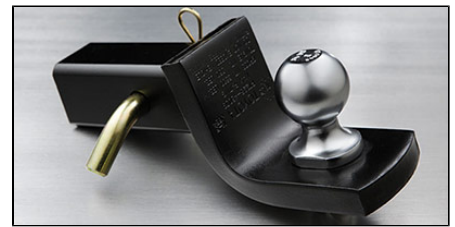
TRAILER HITCH BALL - 17/8" $50.69*

Hitches and Accessories have been designed specifically for your vehicle. Please consult your Lexus Dealer for vehicle specific information. * Note: Trailer Ball sold separately.