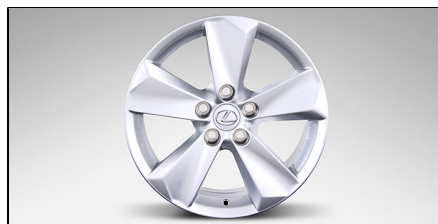
17" WINTER ALLOY WHEELS (5 SPOKE)

Hitches and Accessories have been designed specifically for your vehicle. Please consult your Lexus Dealer for vehicle specific information.