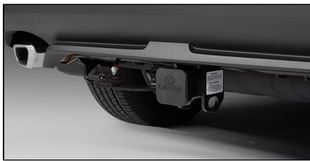
TOWING HITCH WITH WIRE HARNESS - 2 INCH RECEIVER $1,402.60*

The Genuine Lexus Side Window Deflectors are aerodynamically shaped to minimize wind noise and buffering when driving with open windows. The deflectors are designed to integrate flawlessly with your Lexus, while maintaining its sleek look. Breathe in the fresh air without having to worry about wind, rain or the cold Canadian snow.