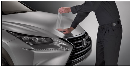
PRO SERIES PAINT PROTECTION FILM $432.00*

The Genuine Lexus Pro Series Paint Protection Film is designed for the hood and front fenders and helps guard your vehicle from weathering, UV radiation and road debris that can chip and scratch the finish. Constructed from transparent thermoplastic urethane, the clear-coated film helps maintain a like-new appearance for your Lexus.