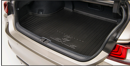
CARGO LINER $190.70*

The Cargo Liner provides maximum protection for your cargo area and features a raised lip around the perimeter of the tray to help keep dirt and spills within the cargo tray area. Its light but tough construction allows the tray to be easily removed for cleaning.