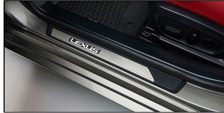
FRONT ILLUMINATED DOOR SILL PROTECTORS $430.31*

The Cargo Liner provides maximum protection for your cargo area and features a raised lip around the perimeter of the tray to help keep dirt and spills within the cargo tray area. Its light but tough construction allows the tray to be easily removed for cleaning.