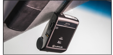
LEXUS GENUINE DASH CAMERA $687.10*

Heighten the thrill of stepping into your Lexus with illuminated door sills for the driver and front passenger doors. Precision-contoured to fit the vehicle, the sills feature brushed heavy-gauge stainless steel to help protect against unsightly scuffs, scrapes and scratches. The front door sills feature LED illumination of the Lexus name in glowing white for gas models or "hybrid blue" for hybrid models whenever the front doors are opened. These illuminated door sill enhancements are designed to meet Lexus high standards for precision fit and finish, so you can be assured of long-lasting beauty and durability. Kit of 2 (front).